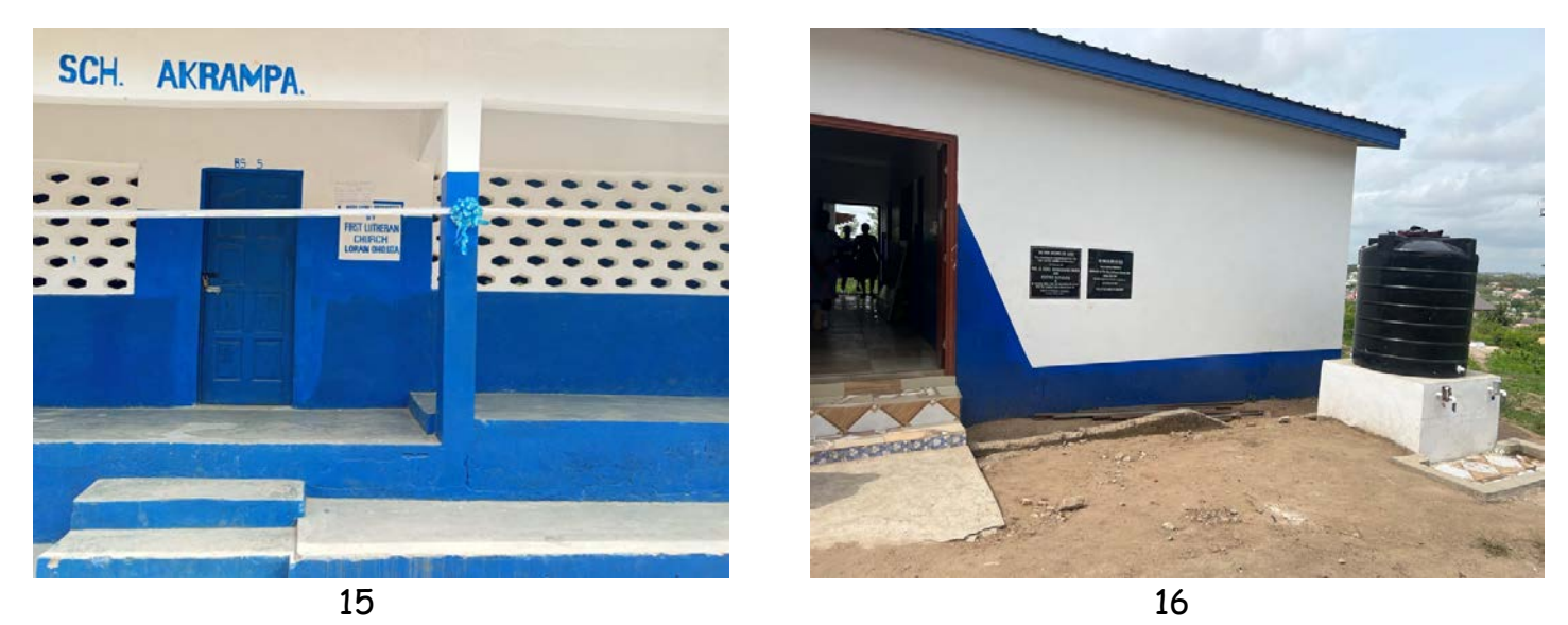
Photo 15 - Shows a portion of the front side of the Upper Primary Block ( 4^{th}-6^{th} Grade). This is specifically in front of the 5^{th} Grade Classroom, to show both the ribbon for the celebration, but also another painted sign next to the door, saying the building has been provided by First Lutheran. The school is newly painted in the blue and white as part of our 2025 renovations.

Photos 13 & 14 - Show the Lower Primary School (1<sup>st</sup>-3<sup>rd</sup> Grade) on the day of the Dedication Celebration. The block of classrooms is wrapped in a ribbon, for the Ribbon Cutting Ceremony. Photo 13 - shows the front end of the building, displaying the sign in honor of First Lutheran's 30-year commitment to the Mission. And Photo 14 - shows the backside of the building with the doors to the classrooms and the New Roof. A student walks under the newly created breezeway, thanks to this project the new support pillars were created to accomplish this protection for the students during the rainy season.